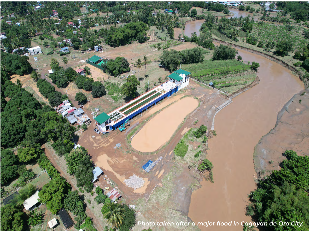
Photo taken after a major flood in Cagayan de Oro City.

Owner : South Balibago Resources, Inc. (SBRI) Year Completed : 2022 Contract Name : Engineering, Procurement & Construction of a 10 MLD Water Treatment Plant in Cagayan de Oro City, Misamis Oriental