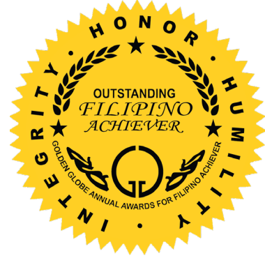
2023 Golden Globe Annual Awards for Filipino Achiever

The Golden Globe Annual Awards for Business Excellence is an award-giving body for business' and personalities in different kind of field. This prestigious award is a joint undertaking of National Data Research Examiner and Marketing Services Inc., SINAG News Magazine and SINAG Foundation.